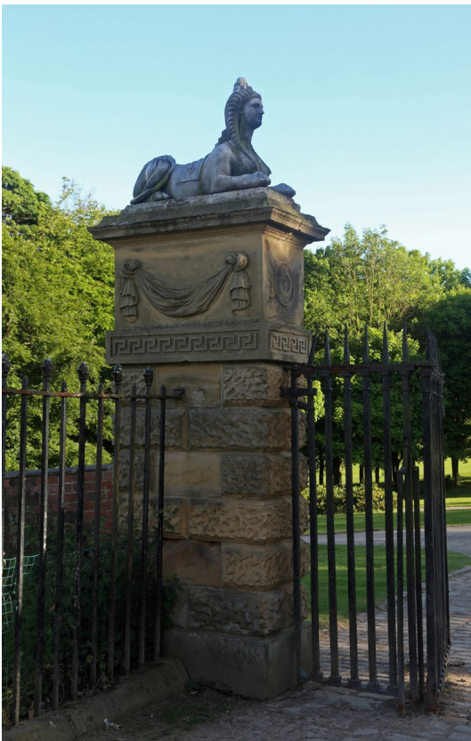
Sphinx gates near the stable block

Brown placed a small, pedimented temple on the hill as an eye-catcher, with a clearing around it to give a view back to the house. In around 1768 he moved the approach to the house away from the north lodges, creating a more winding route and used 'curious and hardy shrubs' along the walks. He removed the stable block and riding school from view, so that the house became the main feature of the estate. The Sphinx gates below the stable block are copies of those designed by Lord Burlington for Chiswick, which haven't survived. The gates were cast in 1768, and cost £47 and 5 shillings (around £80,000 in 2015).