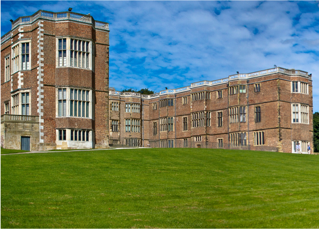
Temple Newsam

Lancelot 'Capability' Brown remodelled the gardens at Temple Newsam in 1765–1771 for the 9th Viscount Irwin. Brown's master plan for Temple Newsam, near Leeds, West Yorkshire, is dated 1762. He had been invited to the estate by Viscount and Lady Irwin as early as 1758, but it was not until 1760 that a payment to him of £40 (around £67,000 in 2015) was made. Some initial planning may have been done then, as work was carried out in the plantations in 1760, possibly to set up a nursery.