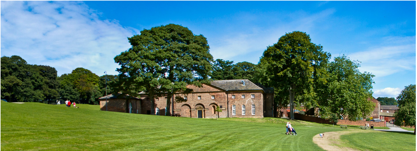
Stable buildings at Temple Newsam