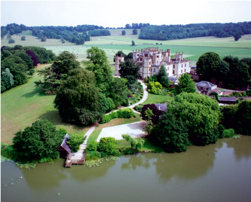
Aerial view of Sherborne Castle and lake