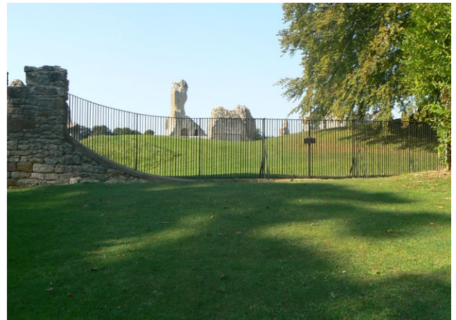
The Clairvoire gates

The walled Parlour Garden to the east side of the house was removed so that Brown could lay the East Lawn, giving uninterrupted views out into the deer park. He also levelled terraces to create the North Lawn and built a ha-ha (sunken wall and ditch) around the East Lawn to keep animals out.