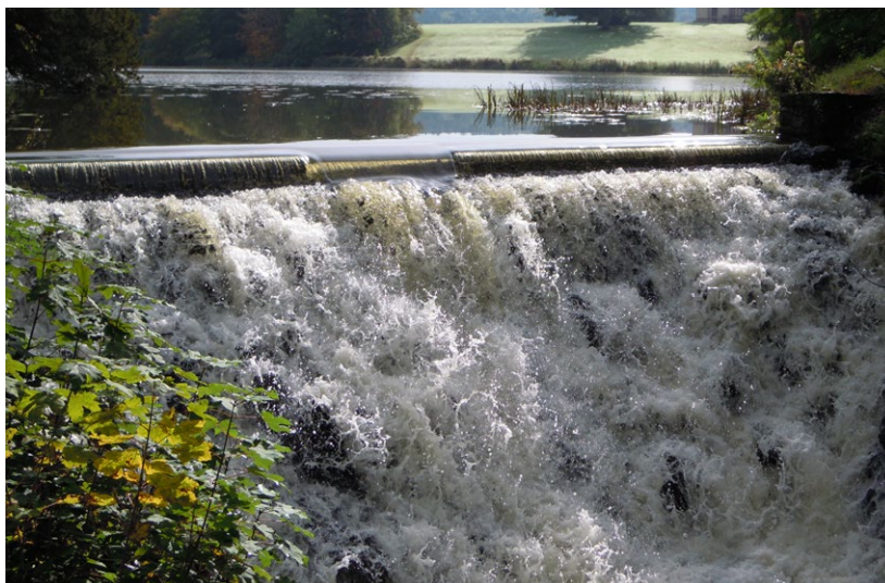
The cascade at Sherborne Castle

Where the valley narrows on the northern side of the outflow from the lake, Brown built a spectacular rocky cascade. The northern bank of the lake was planted with mature cedars and other specimen trees. On the south-facing bank some of the terraces from the old formal gardens were kept.