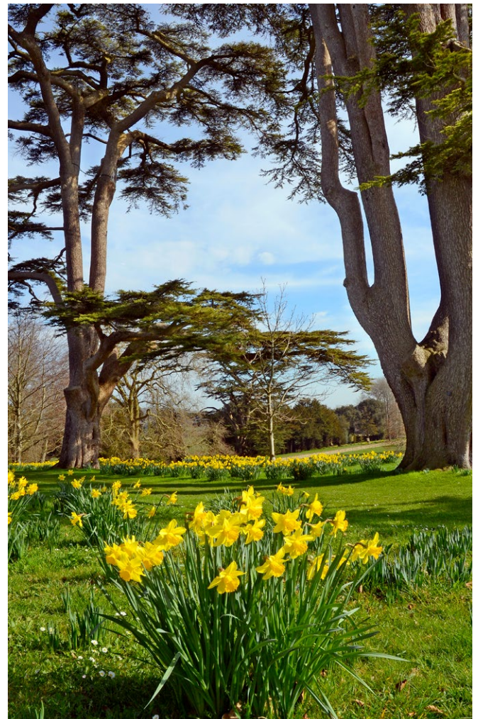
Cedars at Sherborne

Sherborne remains an outstanding example of an unaltered Capability Brown landscape. The family and the Head Gardener work to maintain Brown's vision, regularly replanting shrubs, trees and herbaceous borders at the estate.