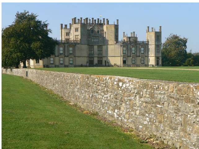
East Lawn and ha-ha