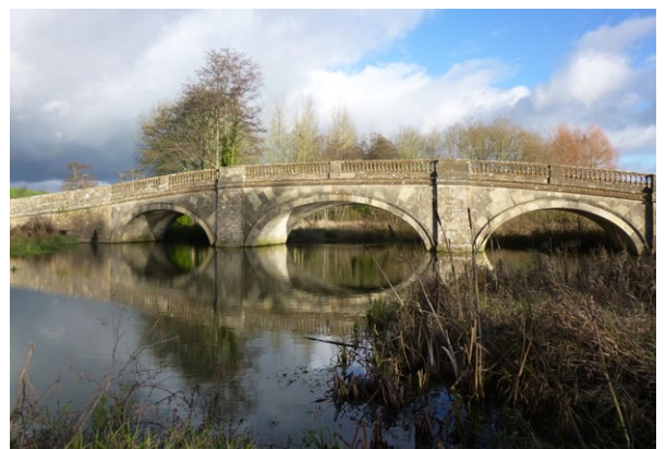
Bridge across the lake

One of the stopping points on the route around the lake was Raleigh's Seat, the viewing spot that former owner Sir Walter Raleigh had built against the park wall in the north-east.