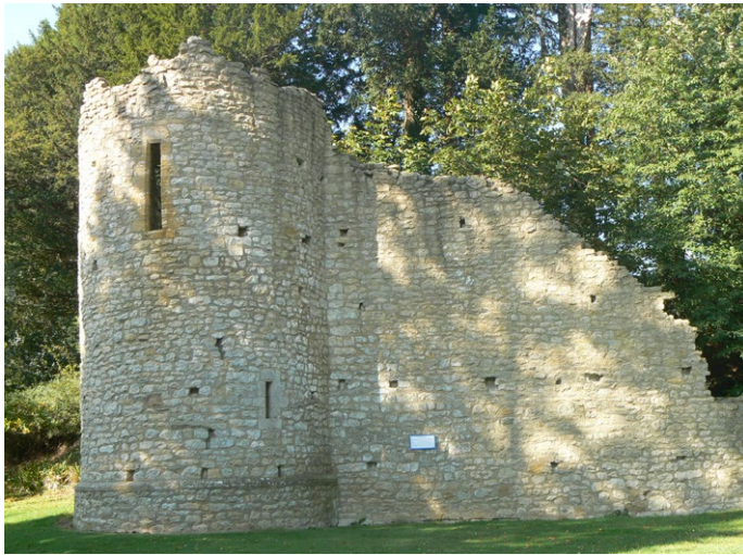
The mock-ruined tower built by Daniel Penny