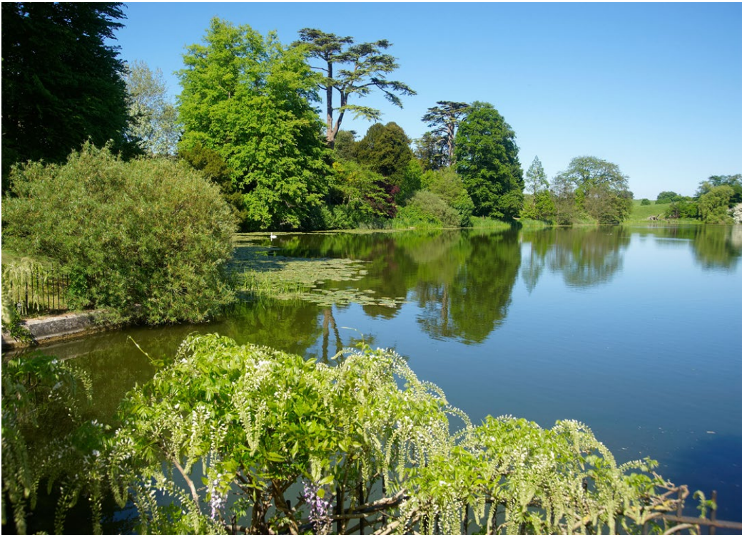
Capability Brown's lake

From 1753 Capability Brown landscaped the grounds at Sherborne in two phases, creating the beautiful lake that dominates the park and later remodelling the pleasure grounds.